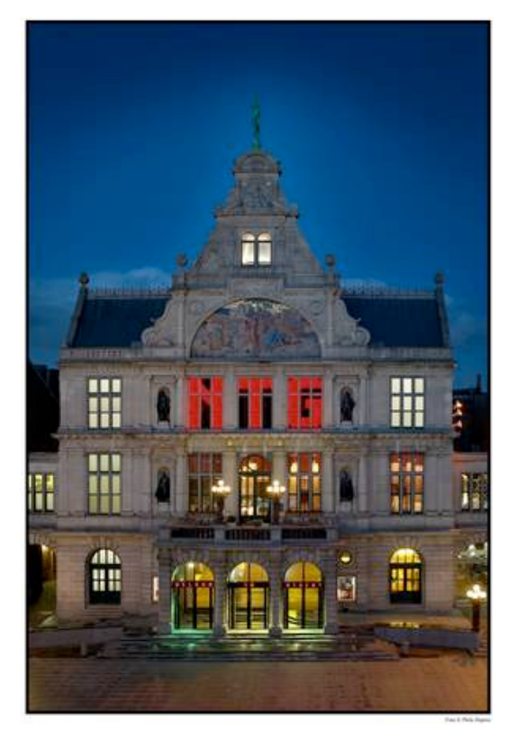
<u>Picture 1</u>: The "Dutch Theatre" building illuminated consistent with the Ghent light master plan